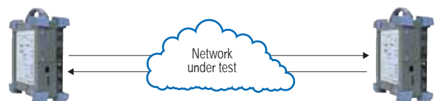
■ Dual-test-set configuration (arrows show direction of traffic).

This tool lists all client-configured routers identified between the local and the destination IP address, within a given delay. When link routers respond to the ping command, the route and statistics are collected by the local module from these replies. Results collected include the IP address of routers in the link and the response delay, round-trip time measurement and a count of frames sent and received. The user also has the ability to configure the parameters of the trace route.