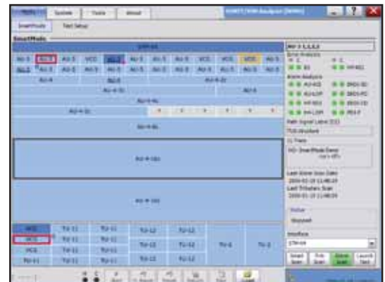
■ FTB-8120NGE/8130NGE SmartMode: multichannel signal discovery with real-time alarm scan (shown in the FTB-400 user interface).

SmartMode automatically discovers the signal structure of the OC-n/STM-n line including mixed mappings and virtual concatenation (VCAT) members. In addition to this in-depth multichannel visibility, SmartMode performs real-time monitoring of all discovered high-order paths and user-selected low-order paths simultaneously, providing users with the industry's most powerful SONET/SDH/OTN multichannel monitoring and troubleshooting solution. Real-time monitoring allows users to easily isolate network faults, saving valuable time and minimizing service disruption. SmartMode also provides one-touch test case start, allowing users to quickly configure a desired test path and SmartMode specific reporting.